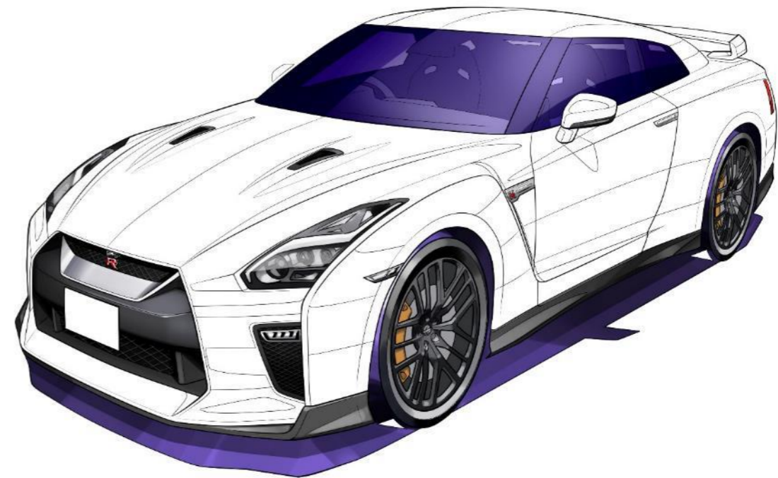
Coloring sheet (with color separations)