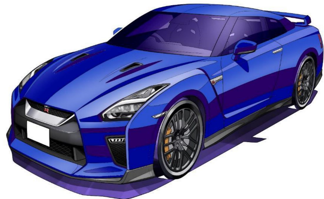
Completed image (sample)