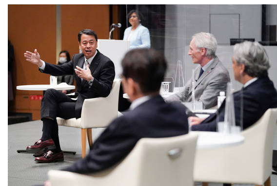
In May 2022, Nissan hosted a townhall meeting of head of Alliance and member companies with key leaders in Nissan and Mitsubishi Motors

Between now and 2030, the Alliance's momentum will expand at a pace it has never experienced in the past.