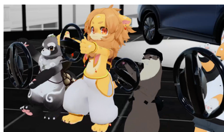
Virtual "Wheel Spinning (Guru-Guru) Exercise"