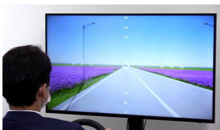
Effective field of view measurement system

* Effective field of view refers to the range at which drivers are able to discern objects that they need to identify.