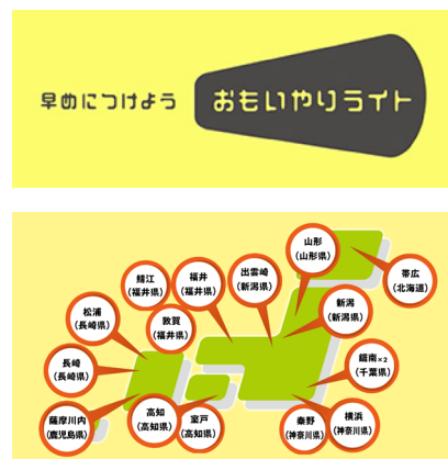
Nationwide voluntary participation in the campaign to turn on headlights

On November 10, designated “Day of Good Lighting,” we supported people in 16 regions nationwide in taking the initiative to encourage drivers to turn on their headlights before dark. In addition, the TRY-LIGHT ONLINE forum was held in December 2021 to promote safety in a fun way befitting the Omoiyari Light Promotion. This year, under the theme of “Traffic safety created by women, led by women,” an initiative discussed a variety of ideas from the perspectives of called-upon journalists and participants from all over Japan as well as from the side of drivers. This event was also streamed, and we received comments from viewers in support of the movement. Throughout the year, the Global Headquarters Gallery hosts daily presentations at dusk about the Omoiyari Light Promotion during which