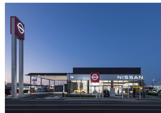
New logo Nissan dealer outlet

Focusing on the voice of each individual customer and quick problem resolution, we also implemented Quick Voice of Customer (Quick VOC). It is not a survey but rather a powerful tool to capture customer's feedback with three simple questions and free comment. In case a customer shows any concern, Quick VOC provides the Dealer / Nissan a hot alert and allows the Dealer to quickly resolve the specific customer's concern and thereby increases customer promotion for Nissan. We continue to improve the quality of our sales and service in order to improve satisfaction among customers who visit our dealerships.