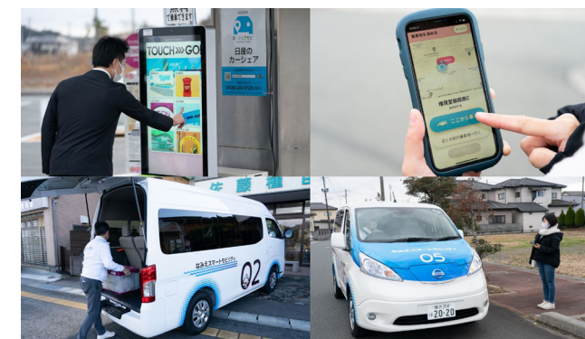
Namie Smart Mobility