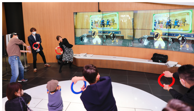
“Wheel Spinning (Guru-Guru) Exercise” connecting the real to the Metaverse.

Activities this year included performing an evaluation experiment with the participation of elderly drivers on the “effective field of view*1 measurement system” developed last year, as well as a visibility evaluation experiment of colors of pedestrian clothing using character figures and an actual car. Research results will be published on an ad-hoc basis.