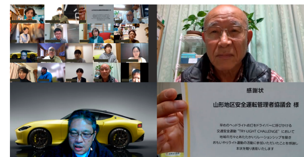
TRY-LIGHT CHALLENGE debriefing session

On and around November 10, designated "Day of Good Lighting," we supported people in 96 locations nationwide from Hokkaido to Kagoshima in taking the initiative to encourage drivers to turn on their headlights before dark. In addition, the TRY-LIGHT CHALLENGE debriefing session was held in December 2022 where participants from around Japan shared their ideas and tips to get drivers to turn on their headlights. The participants encouraged each other, and the session gave rise to new insights.