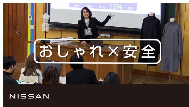
Visibility evaluation experiment of colors of pedestrian clothing using character figures and an actual car

experiments to be conducted throughout the year. From October 2022, “mini digital stops” for actual retail stores were introduced to improve and expand convenience for users and support driving customers to such stores. Furthermore, in January 2023, the “Namie Smart Mobility” fare was established moving the project into the final stage of proof-of-concept experiments toward commercialization. By making the service for-pay, we will verify the degree to which users and the community are willing to accept a service with fares. We also aim as build a model to commercialize sustainable mobility services, including future service expansion, even in areas with low population density. We are also pleased to note that in October 2022, this initiative received the “GOOD DESIGN AWARD” sponsored by the Japan Institute of Design Promotion.