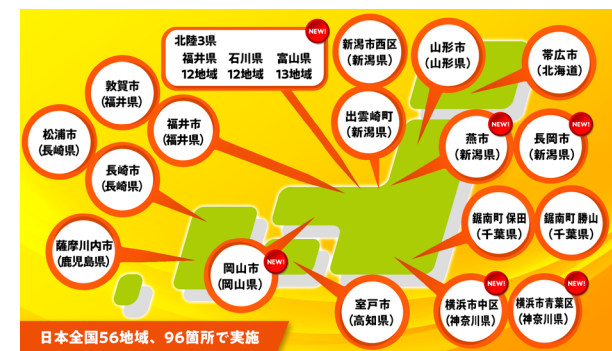
Nationwide voluntary participation in the campaign to turn on headlights

On and around November 10, designated "Day of Good Lighting," we supported people in 96 locations nationwide from Hokkaido to Kagoshima in taking the initiative to encourage drivers to turn on their headlights before dark. In addition, the TRY-LIGHT CHALLENGE debriefing session was held in December 2022 where participants from around Japan shared their ideas and tips to get drivers to turn on their headlights. The participants encouraged each other, and the session gave rise to new insights.